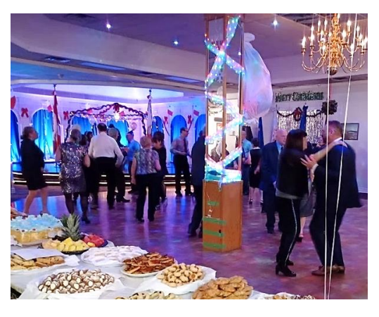
@ @ @

Thanks to everyone for your support in 2023 and we look forward to seeing you at the club in 2024!