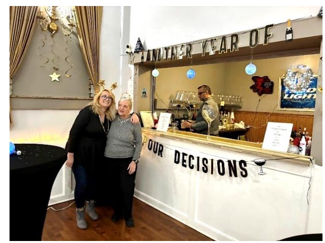
This was the Club's first New Year's Eve party in some 18 years.