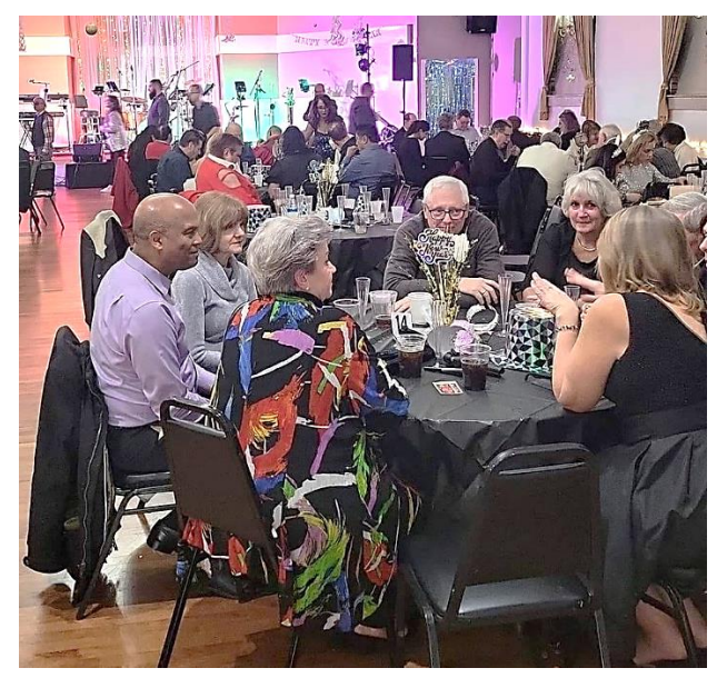
Rocking in New Year's Eve MACC style with Packin' Heat.