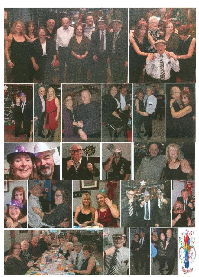
NEW YEAR'S EVE DINNER DANCE THE MALTESE CANADIAN CLUB OF LONDON Friday, December 31, 2010