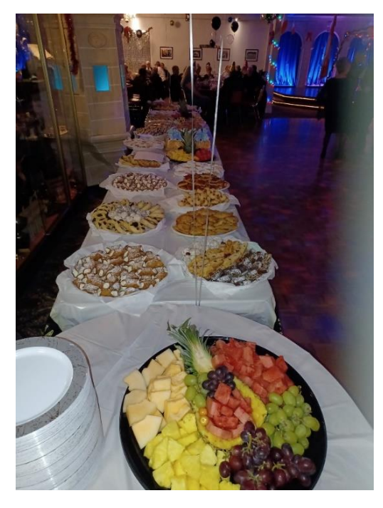
The Sweet Table

A fruit and pastry bar was setup for everyone's enjoyment as 2023 was coming to a close.